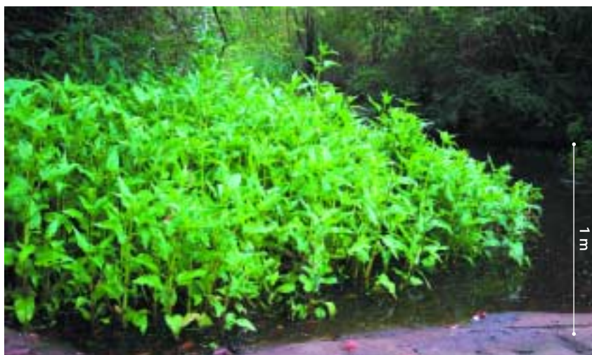
Senegal tea plant can grow out from riverbanks and cover the surface of still or slow-moving waterways.

It is also very difficult to control because it can spread by both seed and vegetative reproduction. Even tiny pieces of vegetation can give rise to new colonies. Because it is found mainly in water, the potential impacts of herbicides on non-target plants and animals must also be carefully managed.