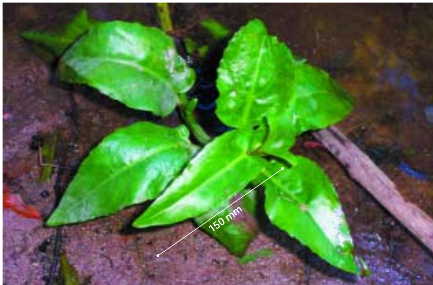
The dark green leaves are long (up to 200 mm), spearhead-shaped and serrated on the edges.

Vegetative spread occurs when any part of the stem that includes a node breaks away from the main plant, eg in fast flowing water. When the stem fragment settles on the stream bed it sends out fine roots from the node, and can grow into an entire new plant. This new plant can spread quickly and create a colony by producing roots where nodes come in contact with moist soil. Stem fragments can also be accidentally spread by transport of machinery (eg boats, trailers, lawnmowers) or in animals' hooves.