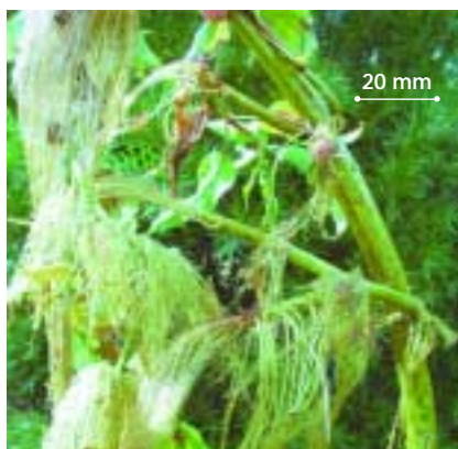
The fibrous root system develops at any node in contact with water or moist soil.

Despite these successes, controlling and hopefully eradicating Senegal tea plant requires an ongoing commitment, particularly if this weed continues to be illegally planted.