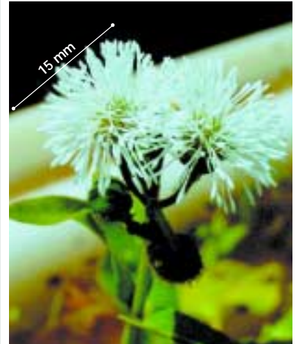
The importation of Senegal tea plant into Australia is not permitted as, among other reasons, increased genetic diversity could lead to increased seed production ability.

Senegal tea plant was introduced into Australia from India by the aquarium industry. It was first recorded as growing in the wild in the Manning River near Taree, New South Wales, in 1980. Several other infestations have been recorded throughout New South Wales and Tasmania, with more recent spread recorded at several sites in and around Brisbane. Infestations were recently recorded from Perth and at Lake Nagambie and Cranbourne South in Victoria.