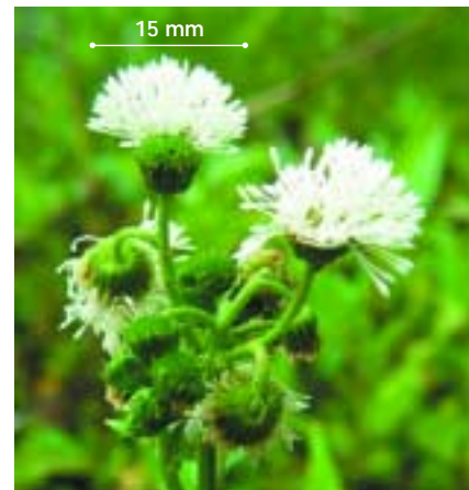
The white ball-shaped flowers are a distinctive feature of Senegal tea plant.

A quick identification aid is that any water plant with white, ball-shaped flowers is likely to be a weed, either Senegal tea plant or the Weed of National Significance , alligator weed ( Alternanthera philoxeroides ). Senegal tea plant has serrated leaf edges