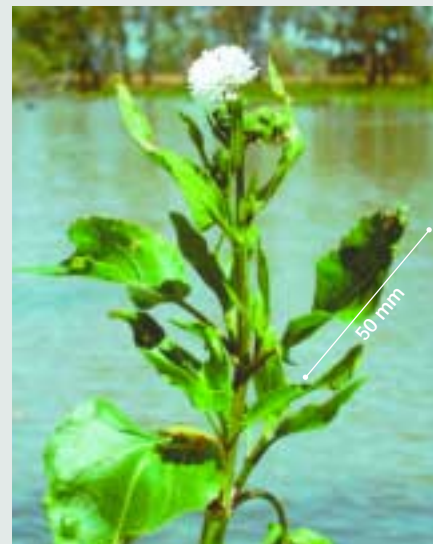
Flowering occurs in spring and summer.

Other methods of weed control have also been trialled. Hand pulling of small patches did not remove all plant parts, and infestations were able to regenerate and spread further. Mechanical removal of infestations has been used where de-silting operations were also required to clear drains. First, infestations are