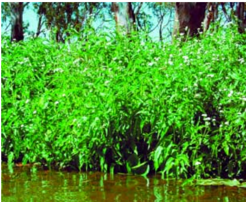
Senegal tea plant is mainly spread through human activities, particularly the careless disposal of aquarium plants in creeks and drains.